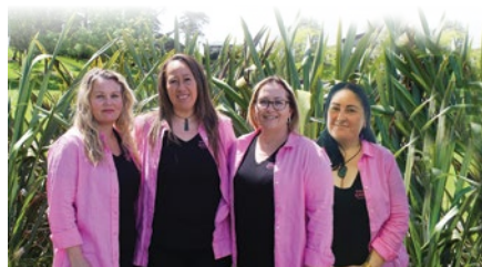
KCFT Attendance Services Team