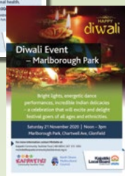
KCFT Events Team